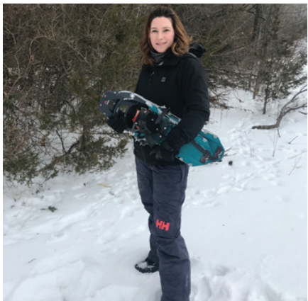
Story on page 6