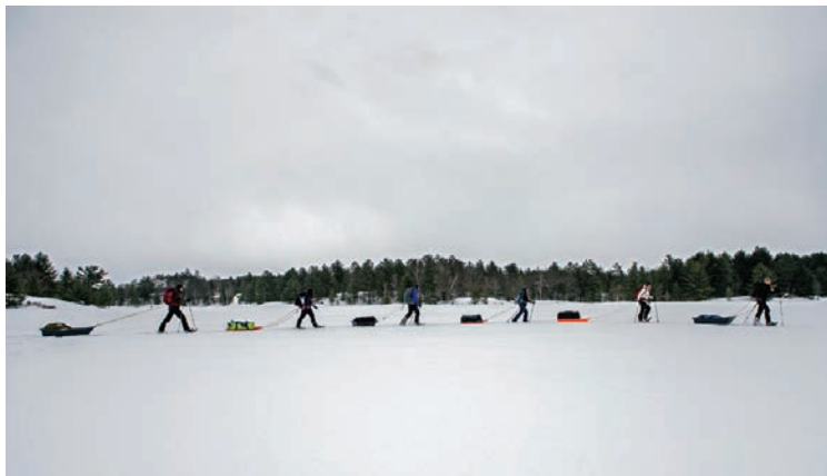
The women of the Baffin Island expedition during training camp as they practice pulling their gear on sleds.