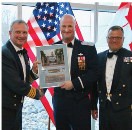
Story on page 7