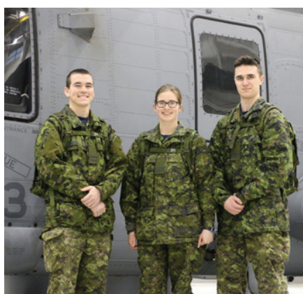
Story on page 5